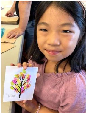
Turkeys and Cards