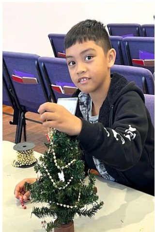
Snowflakes and Trees