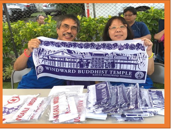
Bon Dance July 13, 2019